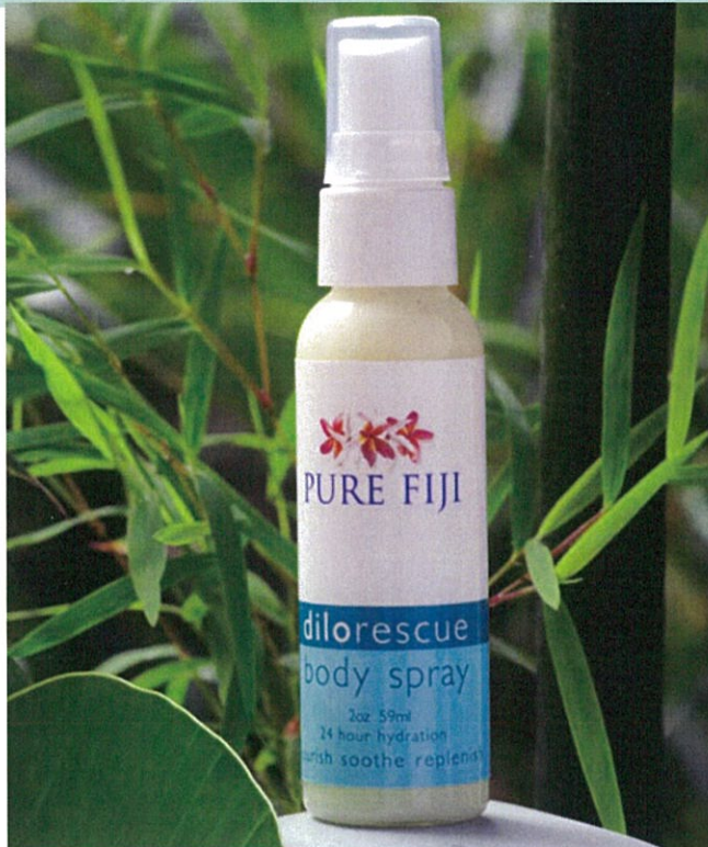
Dilo Rescue Spray 8oz/236ml, 2oz/60ml

Rehydrates your skin, releases tension in muscles to restore balance and calm and revitalizes your body with essential oils.